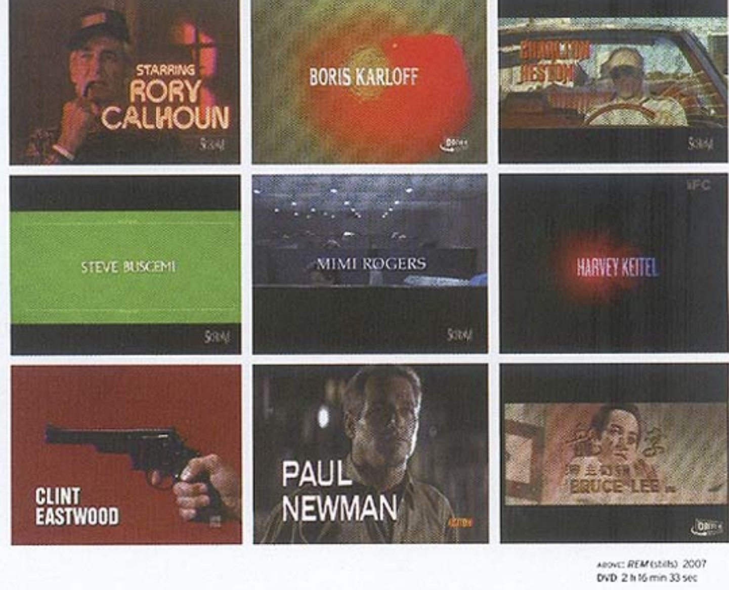
ABOVE: REM (still) 2007 DVD 2 h 16 min 33 sec OPPOSITE: The Kiss (from the Glow Video Series) 2007 2-channel DVD installation, 15-min loop, silent

dinary feats of endurance (perhaps most famously, he spent an entire year tied to the artist Linda Montano by a rope, with the two trying not to touch). His use of the calendar year to structure each performance gives his work a conceptual clarity that invites his audience to contemplate the meaning of time and the arbitrary nature of our frameworks for measuring it.